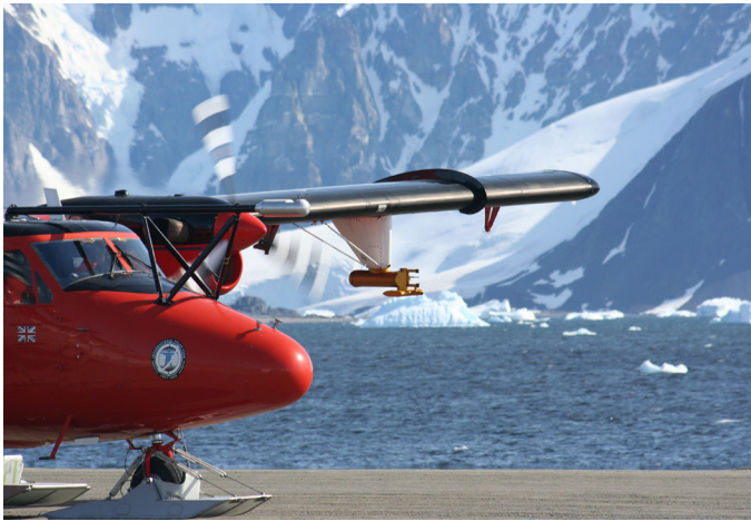
A DMT CAPS probe mounted on a British Antarctic Survey Twin Otter.