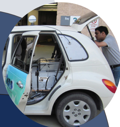
EPA Mobile Sampling Unit with SP2

Suitable for airborne or ground-based (fixed-site or mobile sampling)