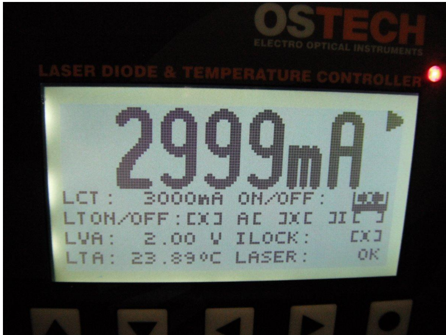
Figure 2: Laser Controller Screen with LTON/OFF Set to ON and Laser ON.